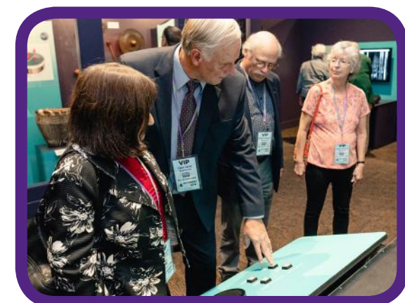
Guests make music and play with sound at the SoundSense VIP event.