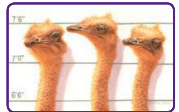
Rachelle Siegrist; The Usual Suspects, 2017 ; watercolor on crescent rag board; 14 ½ x 16 ½ x 1 1/2

Three simple words—birds in art—took on multidimensional significance as an exhibition title in the mid-1970s. Birds in Art is internationally recognized as setting the standard for avian-themed art. Each year the Leigh Yawkey Woodson Art Museum in Wausau, Wisconsin invites contemporary artists working in a variety of mediums to submit art interpreting birds—or even the suggestion of a bird—for jury consideration. The Birds in Art phenomenon is a tribute to the more than 1,000 artists whose works have comprised the annual exhibition since 1976.