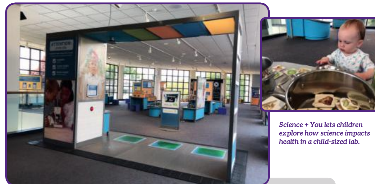
Science + You lets children explore how science impacts health in a child-sized lab.

Science + You will be open on the 2nd floor of the Museum through August 5.