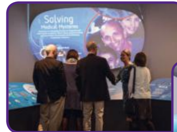
Guests enjoying the exhibit's medical side. This shows how the genome is used in cancer research.